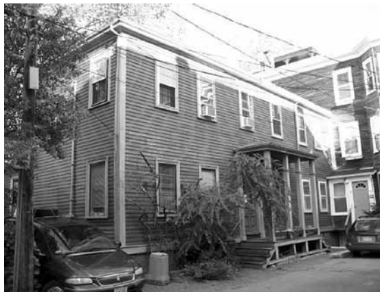
Opposition House in 2008.