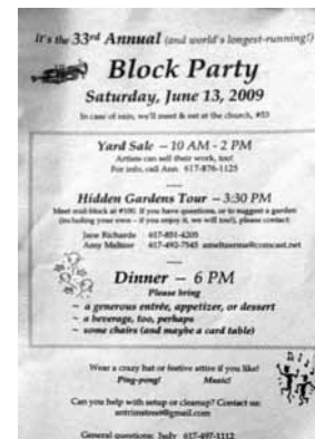
Early flier, courtesy of George Metzger

We never collected any money; we outlawed politicking; and it remains the longest running block party in the city.