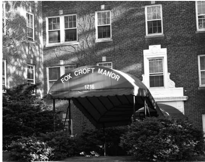
1716 Cambridge Street