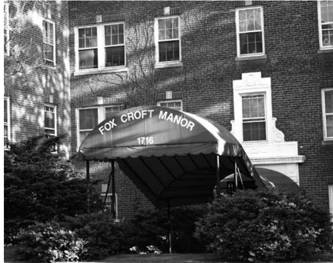
1716 Cambridge Street