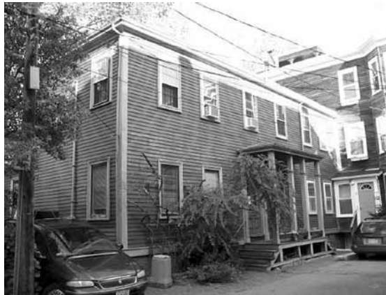
Opposition House in 2008.

At the time, Dana had just retired after 15 years as chief justice of the Massachusetts Supreme Judicial Court. He complained bitterly of the "selfish schemes" of "speculators" who had bought up the land surrounding his and his brother's. So he came up with a scheme of his own.