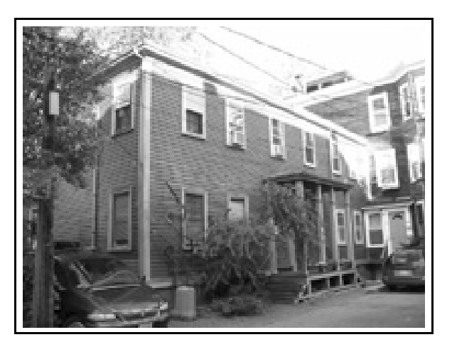
Do you know why Opposition House was built? See page 5.