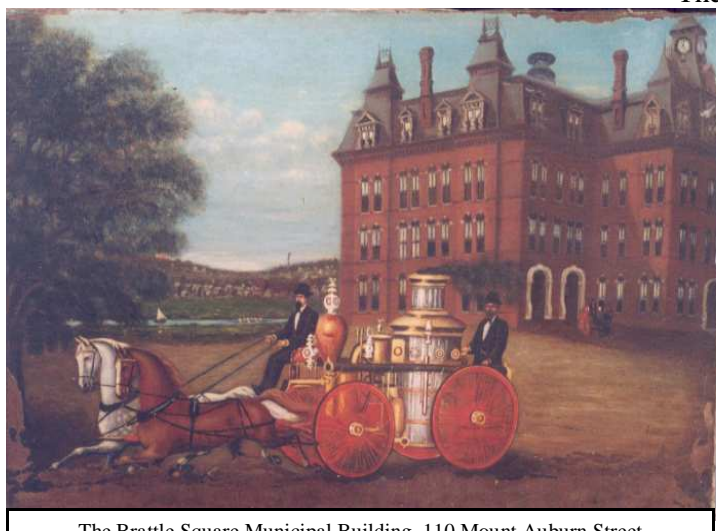
The Brattle Square Municipal Building, 110 Mount Auburn Street

Later, four district stations were established: one on the site of the present headquarters, and others at 34 Fourth Street, at 2101 Massachusetts Avenue, and at 108 Mount Auburn Street in Eliot Square. The Eliot Square building, with three towers, one containing a clock and bell, also housed municipal courtrooms, an armory, and a fire station—as evidenced by the horsedrawn pumper in the contemporary painting reproduced here.